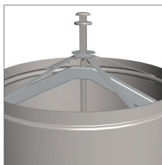
BinSystem 2400 C-KHF with Kinshofer