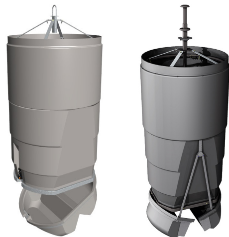
1. Single bottom with quick system